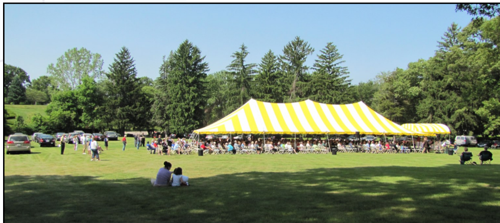
Memorial Day St. Joseph Cemetery 2012