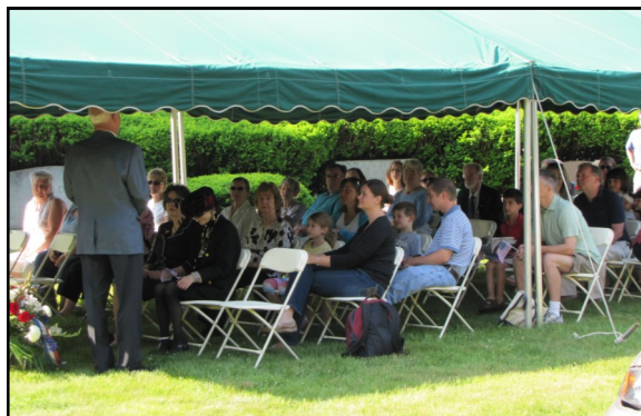
Memorial Day Holyhood Cemetery 2012

Memorial Day is a time for remembering the men and women who died for their Country. The annual Memorial Day Observance Mass continues to grow in attendance numbers with an estimated 1200 at St. Joseph and 100 at Holyhood Cemetery. The increase in family attendance was very noticeable at both cemeteries in 2012. The condition of the cemetery grounds was excellent and volunteers from various schools and veterans organizations did an outstanding job placing flags at all the Veterans graves. This task could not be accomplished without them and the assistance of the very dedicated staff at Holyhood. Monsignor William Helmick and Father Jack Ahern officiated at the services.