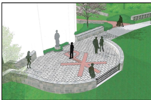
Chapel Hill IV Site Plan

The Association reviewed the site plan for Phase I of the Chapel Hill IV Development and approved development of construction plans. This will be the first phase of a much larger development plan which will encompass the entire hill behind the Chapel when complete. The PX shrubs will be removed and replaced with granite stairs and landings. This area will provide full casket and cremation interment graves. When finished, this development will enhance the beauty and the historic value of the Cemetery.