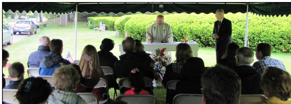
Memorial Day Holyhood Cemetery 2016