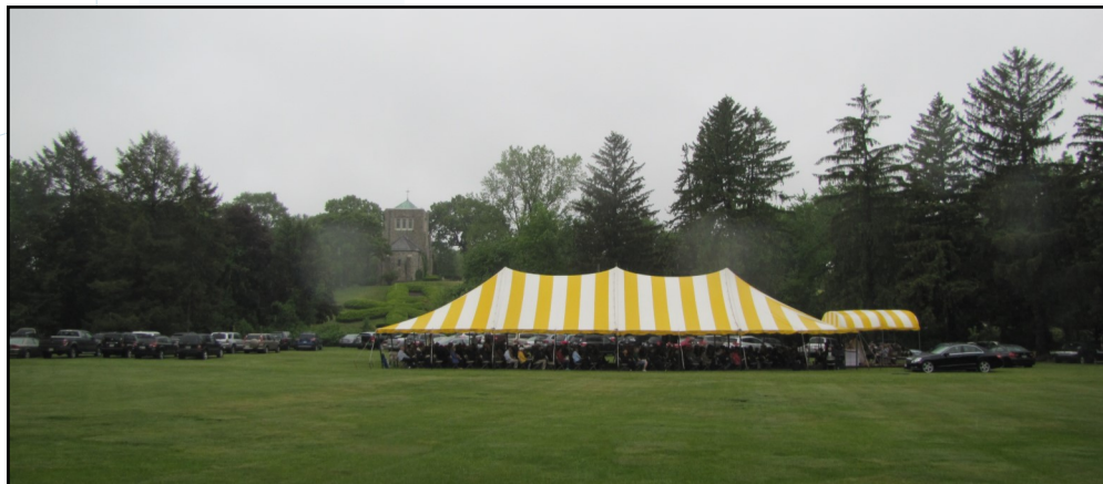
Memorial Day St. Joseph Cemetery 2016