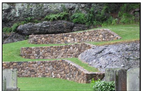
Holyhood Cremation Graves

The Association has three options for interments on the property. Holyhood has a new section that accommodates in-ground cremation burials. St Joseph has available full burial and cremation graves. Maguire Chapel offers glass niches as an alternative to traditional burials in-ground. If you would like more information, please contact a staff member.