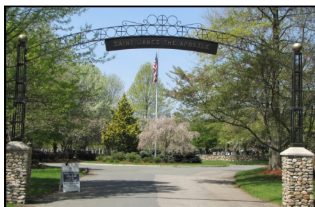
St James the Apostle

The Association has three options for interments on the property. Holyhood has a new section that accommodates in-ground cremation burials. St Joseph has available full burial and cremation graves. Maguire Chapel offers glass niches as an alternative to traditional burials in-ground. If you would like more information, please contact a staff member.