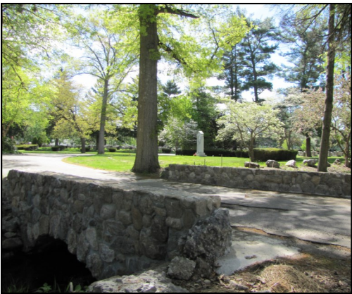
Sawmill Brook Bridge

The bridge which spans approximately 20' over the Sawmill Brook was damaged in several rain storms last fall. The cemetery received approval from the Boston Conservation Commission to proceed with emergency repair of the bridge. This timely repair helped avoid additional cost for the project. The bridge is now secure and any additional flooding should not cause further damage. Our goal in repairing the bridge was to make every attempt to use some of the existing stone in an effort to keep the rustic appearance of the structure. The bridge was kept closed until the project was completed this Spring.