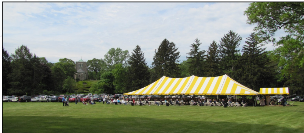
Memorial Day St. Joseph Cemetery 2014