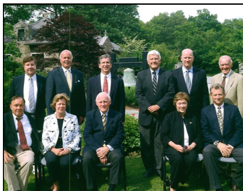
Board of Directors 2008