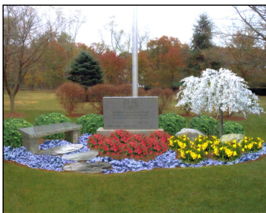
Conceptual Landscape Plan for Veterans Memorial