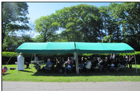
Memorial Day Holyhood Cemetery 2013

Veterans' organizations and volunteers from various schools did an excellent job placing flags. Once again, the weather cooperated and the grounds were in excellent condition.