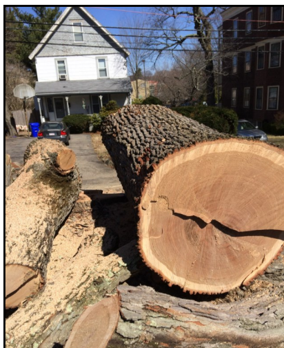
A tree company removes a dead tree from Holyhood Cemetery in Brookline.

Continuing tree care and replacement is essential throughout the cemetery grounds. When windstorms pop up, dead and dying trees drop limbs and large sticks, and those trees in general deter from the visual appeal of the cemetery. In the past two years the Board has approved a removal/replacement program in the Capital Budget. The Master Plan for Holyhood Cemetery in particular has identified a number of trees in need of removal. In some cases these older trees have caused structural damage to the perimeter walls. As we move forward with the program they will be replaced.