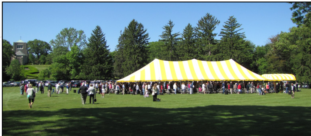
Memorial Day St. Joseph Cemetery 2013