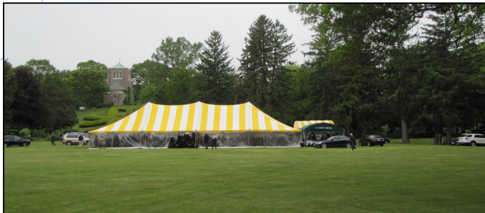
Memorial Day St. Joseph Cemetery 2017