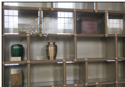
Maguire Chapel Niches