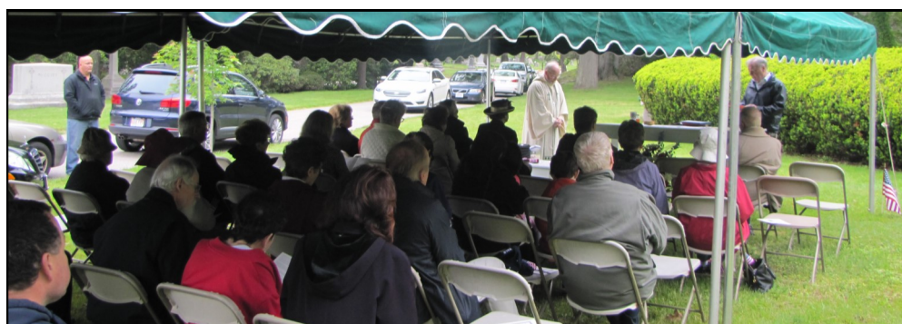
Memorial Day Holyhood Cemetery 2017