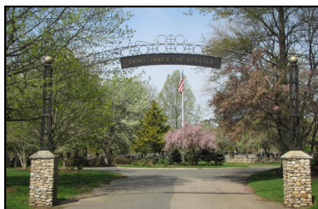
St James the Apostle