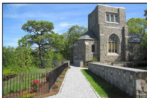
Chapel Hill IV Cremation Wall

If you would like more information, please contact a staff member to arrange an appointment at your convenience.