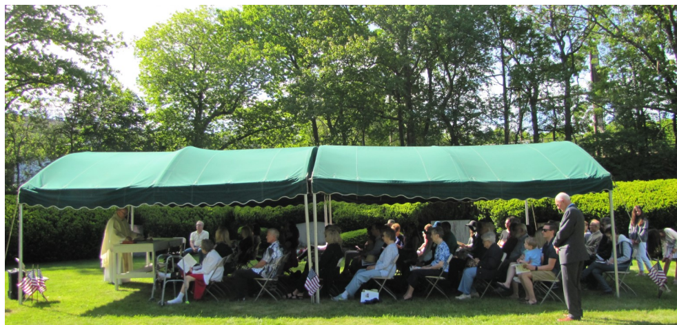
Memorial Day Holyhood Cemetery 2019