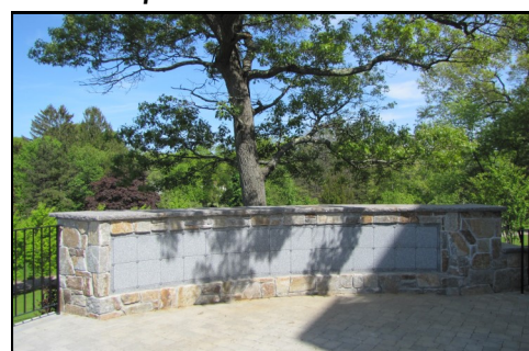
Chapel Hill IV Cremation Niches