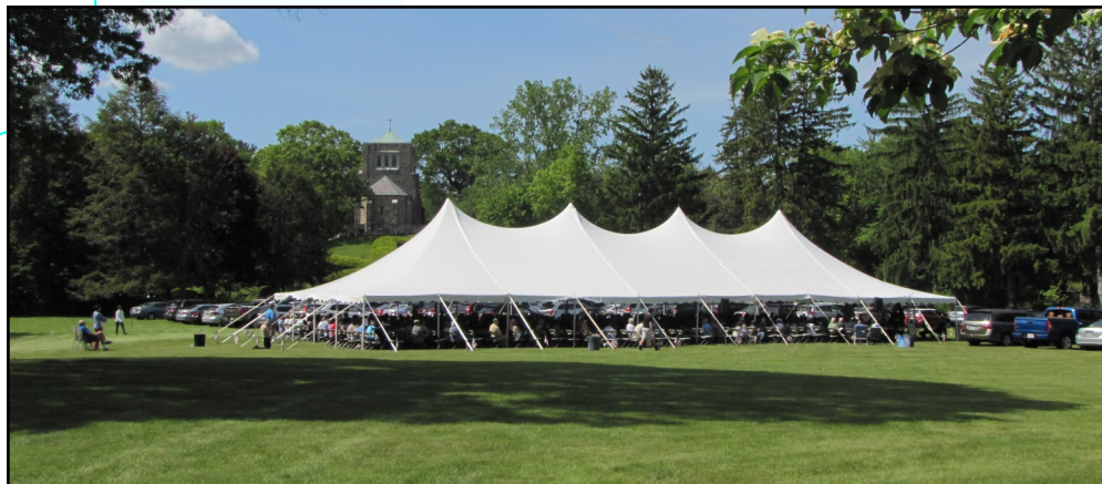
Memorial Day St. Joseph Cemetery 2019