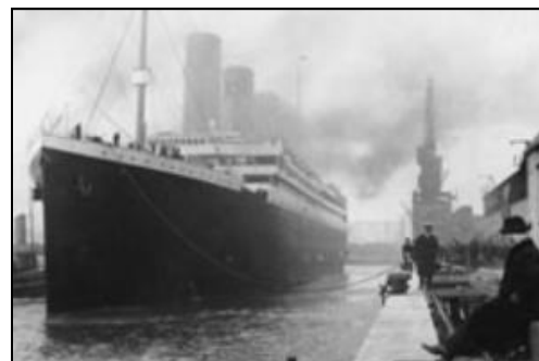
The Titanic sank on its maiden voyage, less than two days before its final destination of New York City