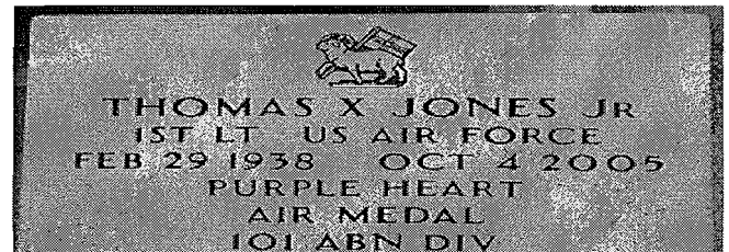
SMALL FLAT GRANITE (L)

This grave marker is 18 inches long, 12 inches wide, and 3 inches thick. Weight is approximately 70 pounds. Variations may occur in stone color.