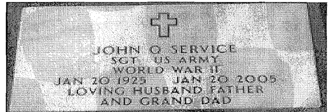
LIGHT GRAY GRANITE (G) OR WHITE MARBLE (F)

This grave marker is 24 inches long, 12 inches wide, and 4 inches thick. Weight is approximately 130 pounds. Variations may occur in stone color; the marble may contain light to moderate veining.